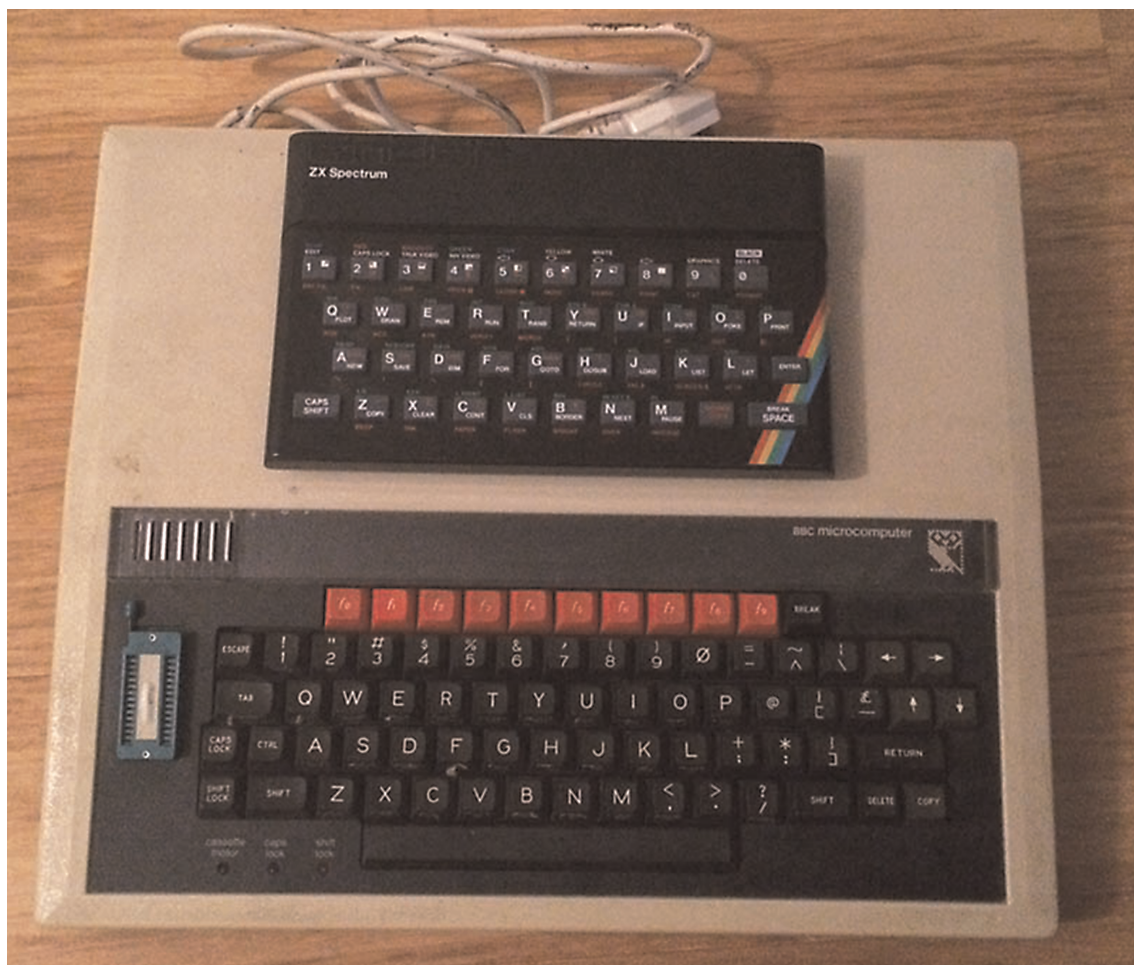
Fig. 1 ZX Spectrum (top), BBC Microcomputer (underneath).

often 'neglected' technologies that play a role in the histories of networked information. By situating some of these developments in the industrial and political climates of the 1970s, this article thus outlines an alternative history of networks through the aerial. The outcomes of these findings are situated in a wider academic discourse about new media technologies and convergence cultures to show the cycles of media distribution offered by a media archaeological approach.