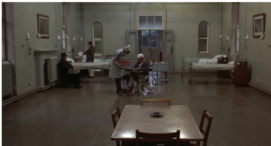
Figure 15. The terminal ward, The National Health (UK, 1973): Screenshot [01:28:59] (Source: Amazon Prime Video. Copyright: Virgin/Colombia).

The terminal ward [Figure 15] stands in for a microcosm of a nation in decline at the start of the 1970s, a decade of economic unrest, unemployment, industrial action and fractures in the national family. 63 The film's narrative is interspersed with a romantic and exciting American medical soap opera (in which the main cast – Jim Dale, Eleanor Bron, Lynn Redgrave – play characters in the film within a film), navigating the tension between how media and television present the health service and its realities.