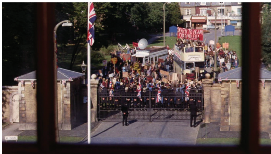
Figure 16. The breakdown of consensus – the view from the private ward, Britannia Hospital (UK, 1982): Screengrab [01:23:50].

Lindsay Anderson's surrealist satire Britannia Hospital , released, shortly before the New Society article on 27 May 1982, offers a trenchant critique of Margaret Thatcher's handling of the NHS by presenting us with a hospital in turmoil. Bedecked in Union Jack bunting in anticipation of a visit by the Queen Mother, patients are left to die unattended in empty desolate hospital waiting rooms, while private patients (including an ex-prime minister and an African dictator) are given luxury treatment in the private wing; in a shiny new research wing Dr Millar (Graham Crowden) is conducting Frankenstein-like experiments; hospital staff are striking and there is a public uprising just outside the gates, while all the time the beleaguered manager (Leonard Rossiter) attempts to maintain a sense of control. The hospital itself is a microcosm of Britain where consensus has broken down entirely [Figure 16].