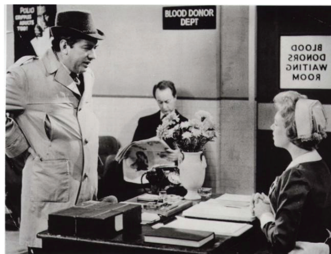
Figure 8. Hancock and the nurse, 'The Blood Donor' Hancock (BBC, 23 June 1961): Screengrab [00:00:22] (Source: BBC DVD/Dailymotion.com. Copyright: BBC).

of the bourgeoisie: the nurse, the doctor, the other patients. The episode begins with two establishing shots of signs reading "South London General" and "Blood Donor Clinic", establishing from the start that this is a drama of the NHS. The tension between the socialist principles upon which the NHS was founded and its administration by bourgeois conservatives is satirised in Hancock's conversation with the nurse in the reception (June Whitfield) [Figure 8]. He tells the nurse, "I've come about your advert! The one on the wall next to the Eagle Laundry in Pelham Rd, next to Hands of Cuba! Just above the cricket stumps!" Here the clinic/NHS is clearly aligned with a leftist ideology (the episode aired in the same year as the Bay of Pigs invasion). Hancock continues unabated with a sense of his own self importance.