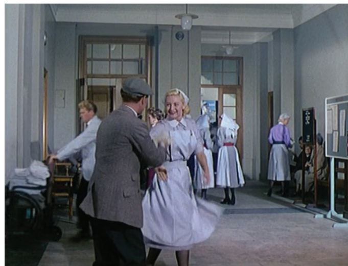
Figures 1 and 2. Doctor In The House (UK, 1964), Screengrab St Swithin's exterior [00:01:56] and interior [00:02:23].

David Kynaston illustrates how the organisational structure or architecture of the new NHS was comprised of several key building blocks (or construction materials): a) it was "Free [at the point of use] and [provided] universal" 17 healthcare for all; b) it was paid for through taxation; c) hospitals were nationalised; d) that most hospitals would be run by a three pronged structure of regional boards, executive councils (overseeing GPs, dentists and opticians) and local authorities; 18 and e) while consultants were still able to practice privately and work for the NHS, the same was not true for GPs who "would no longer be allowed to buy and sell practices but would not be put on a full time salary basis (allowing patients to move between doctors)." 19