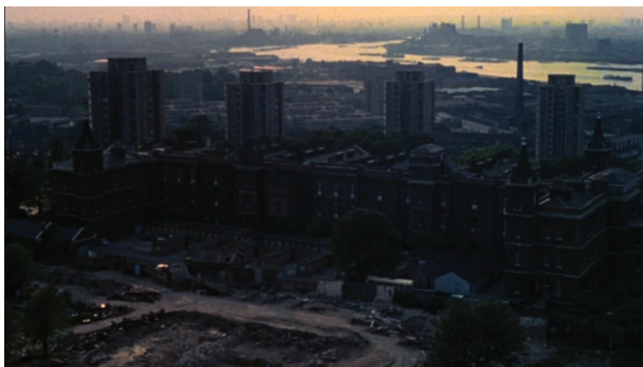
Figure 13. Opening shot, The National Health (UK, 1973): Screenshot [00:00:24] (Source: Amazon Prime Video. Copyright: Virgin/Columbia).

The Eastman Kodak saturated colour of the wards in the Carry On films stand in marked contrast to other, contemporary British hospital film comedies. Both The National Health 59 and Britannia Hospital 60 anticipate Dennis Potter's TV drama The Singing Detective 61 in their depiction of the ward as a bleak microcosm of a Britain in crisis. Jack Gold's The National Health (developed by Peter Nichols from his own stage play) is set in and around a bleak men's terminal ward in an underfunded, struggling NHS hospital, the entrance to which is presided by an imposing statue of Queen Victoria herself (the film opens with a staff announcement they cannot afford the hot water and an order to use what there is economically). The film's establishing exterior shot presents this grim Victorian vision as seemingly out of place in the modern world (something that is explicitly suggested in the opening of Nichols' first draft screen play) [Figure 13]. 62 The film is steeped in irony: at the start a decrepit old lady, a missionary, who looks like a ghost from the previous century, visits the terminal ward to proclaim "the good news" that there is "no death" [Figure 14].