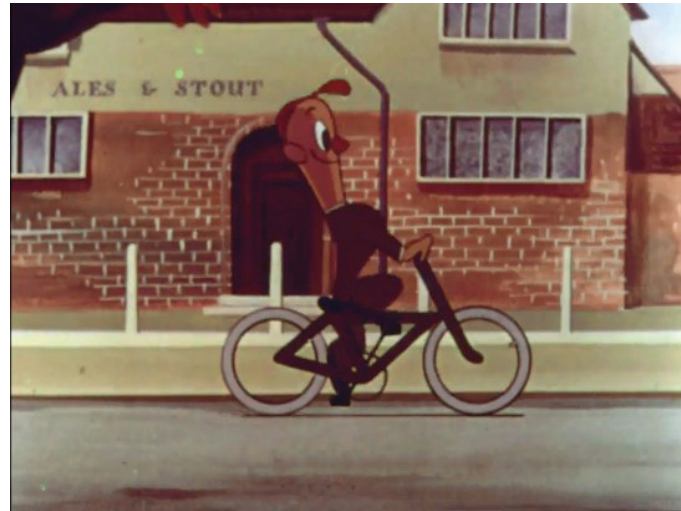
Figure 3. Charley, Your Very Good Health (UK, 1948), Screengrab [00:01:12] (Source: BFI Player. Copyright: UK Crown).