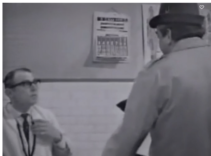
Figure 10. "A pint? that's very nearly an armful!", 'The Blood Donor' Hancock (BBC, 23 June 1961): Screenshot [00:14:17] (Source: BBC DVD/Dailymotion.com. Copyright: BBC).

A pint? Have you gone raving mad? I mean, I came here in all good faith, to help my country. I don't mind giving a reasonable amount, but a pint? Why, that's very nearly an armful!