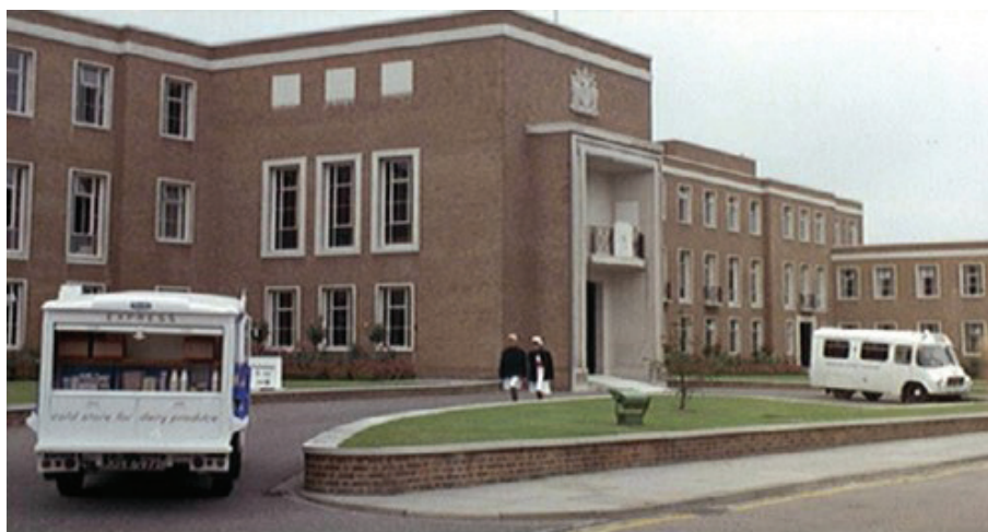
Figure 12. Maidenhead Town Hall, Carry On Doctor (UK, 1968): Screengrab [00:30:22] (Source: DVD. Copyright: Peter Rogers Productions / STUDIOCANAL).

Furthermore, unlike Doctor In The House (see earlier) both Carry on Doctor and Carry on Again Doctor do not make use, in exterior shots, of 'real life' hospitals: instead the modern bureaucratic space of Maidenhead Town Hall [Figure 12] was used in both, distancing the films from medical reality even further. The only film to use a medical exterior was Carry On Matron which made use of Heatherwood Hospital, Ascot, Berks. The distance from medical reality from reality is maintained in the films' bright but minimal design which deliberately replicates the style of Donald McGill's saucy postcards, as Steven Gerrard has noted. 56 The Carry On films were, if nothing else, paragons of efficiency in terms of their labour and money saving art and production design (often making use of recycled props, sets etc.) and, as Laurie Ede points out, art directors Lionel Couch and Peter Vetchinsky set the standard for a mode of production design whose purpose was to frame but not overwhelm narrative, dialogue, script and action. 57