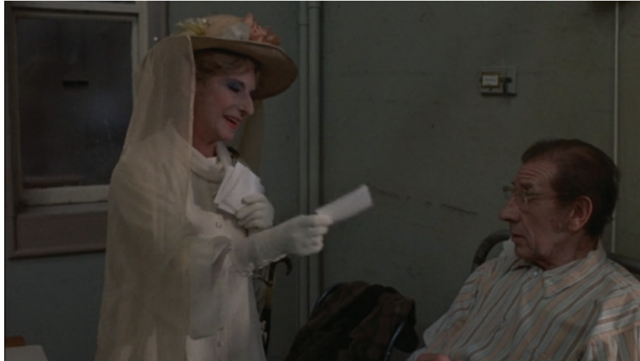
Figure 14. "The Good News", The National Health (UK, 1973): Screenshot [00:02:30] (Source: Amazon Prime Video. Copyright: Virgin/Colombia).

The terminal ward [Figure 15] stands in for a microcosm of a nation in decline at the start of the 1970s, a decade of economic unrest, unemployment, industrial action and fractures in the national family. 63 The film's narrative is interspersed with a romantic and exciting American medical soap opera (in which the main cast – Jim Dale, Eleanor Bron, Lynn Redgrave – play characters in the film within a film), navigating the tension between how media and television present the health service and its realities.