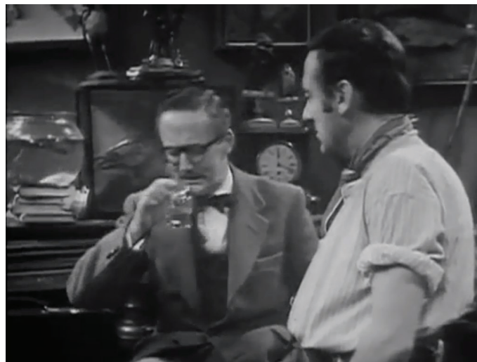
Figure 6. Harold and the Doctor, 'The Holiday' Steptoe and Son (BBC, 12 July 1962), Screenshot [00:26:46], BBC DVD/ Dailymotion.com (Copyright: BBC).