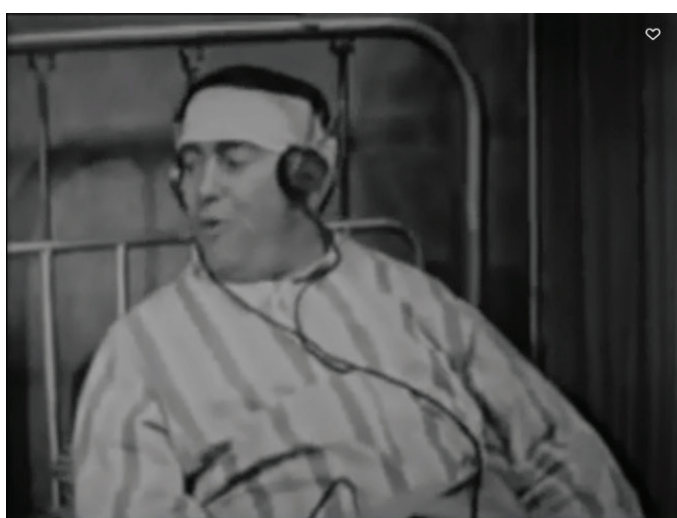
Figure 7. Hancock (back) in hospital, 'The Economy Drive' Hancock's Half Hour (BBC, 23 September 1959): screengrab [00:25:25] (Source: BBC DVD/Dailymotion.com. Copyright: BBC).

In the 'The Blood Donor' Hancock's position again combines both lower middle-class aspiration and the unease of the common man or everyman. The clinic (and by extension the NHS itself) is shown to be dominated by members