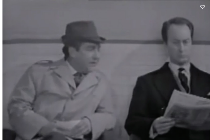
Figure 9. The other patient, 'The Blood Donor' Hancock (BBC, 23 June 1961): Screenshot [00:07:03].

Later with the doctor (Patrick Cargill) Hancock's position shifts again. The fact that Doctor McTaggart is Scottish (albeit with a received pronunciation British accent) bucks Hancock up and appeals to the working-class everyman in him, only to be told by the dour and supercilious medic, "We're not all Rob Roys, you know". The doctor distances himself from working class Scottish traditions, histories and myths, epitomising and legitimising the working-class concerns and suspicions over the educated bourgeoisie articulated by Sid in 'Hancock in Hospital'. The austere attitude of the doctor, nurse (and fellow patient) are attuned to the austere setting and mise-en-scène of the surgery and waiting room – a blank and unwelcoming place with a few measly posters on the wall ("Coughs and sneezes spread diseases") – as Hancock sings to the tune of the German national anthem. This is a microcosm of a post-war no-frills Health Service which serves two conflicting purposes – both a medical environment and a forum for class conflict and debates over consensus.