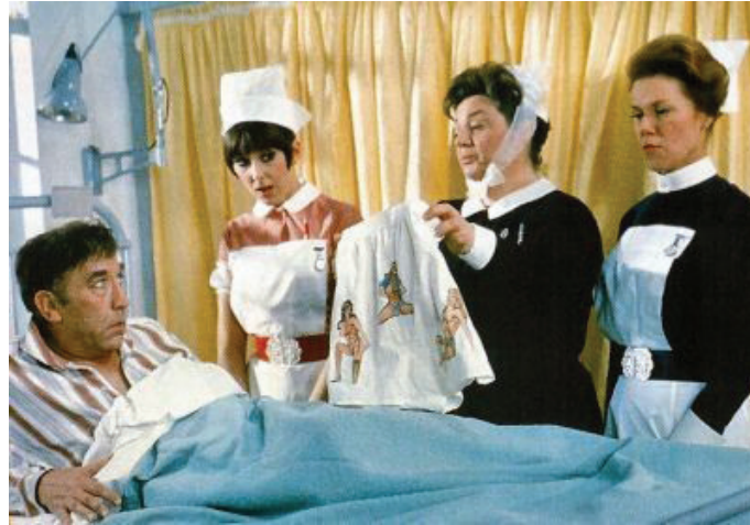
Figure 11. Carry On Doctor (UK, 1968): Screengrab [00:10:40] (Source: DVD. Copyright: Peter Rogers Productions / STUDIOCANAL).

Furthermore, unlike Doctor In The House (see earlier) both Carry on Doctor and Carry on Again Doctor do not make use, in exterior shots, of 'real life' hospitals: instead the modern bureaucratic space of Maidenhead Town Hall [Figure 12] was used in both, distancing the films from medical reality even further. The only film to use a medical exterior was Carry On Matron which made use of Heatherwood Hospital, Ascot, Berks. The distance from medical reality from reality is maintained in the films' bright but minimal design which deliberately replicates the style of Donald McGill's saucy postcards, as Steven Gerrard has noted. 56 The Carry On films were, if nothing else, paragons of efficiency in terms of their labour and money saving art and production design (often making use of recycled props, sets etc.) and, as Laurie Ede points out, art directors Lionel Couch and Peter Vetchinsky set the standard for a mode of production design whose purpose was to frame but not overwhelm narrative, dialogue, script and action. 57