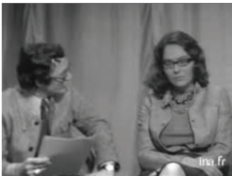
Video 3. 'Affaire talc Morhange' Aujourd'hui Madame, 15 September 1972, Deuxième chaine ['Morhange talcum affair' Today Madame, broadcast on France's second channel]. This was the first televised debate on the Morhange scandal.