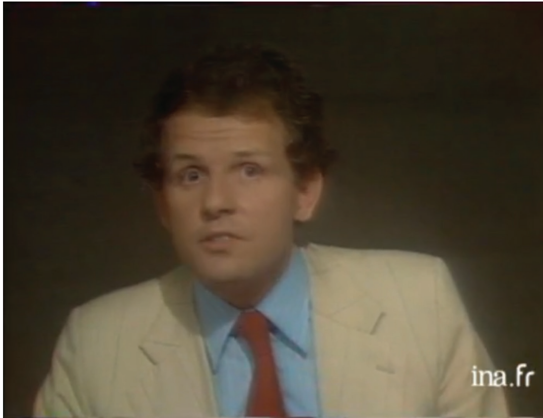
Video 5. 'Talc Morhange', Le journal de 20H , 12 July 1977, Antenne 2 (INA). Victims take centre stage in news broadcasts, such as this one.

In the segment above, excerpted from the 12 July 1977 Antenne 2's evening news, 29 it is a personal testimony of the case that is initially brought up. Then, a family of victims is interviewed about what they had experienced since 1972. The mother speaks about being accused of poisoning her two children; one died and the other remains disabled. The father insists that they have received no assistance to meet the needs of their severely handicapped son.