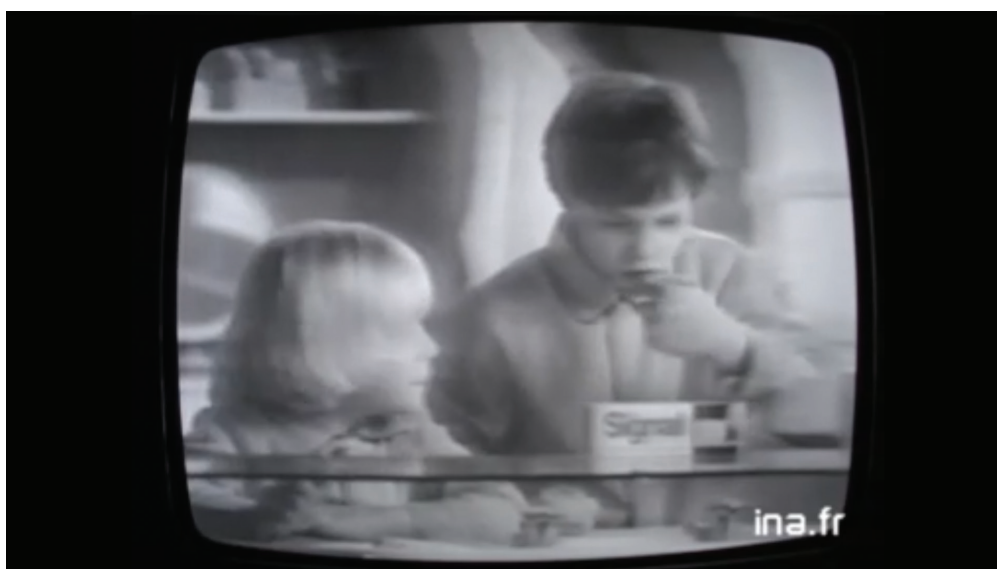
Video 4. Signal: Dentifrice: bactericide [Signal: toothpaste: bactericide], Elida & Gibs, Unilever, 01 January 1970 (INA). Advertisement for Signal toothpaste that used hexachlorophene as a selling point.

the responsibility of advertising, citing an ad for Signal toothpastes that had used the product's hexachlorophene content as a promotional argument since 1969.