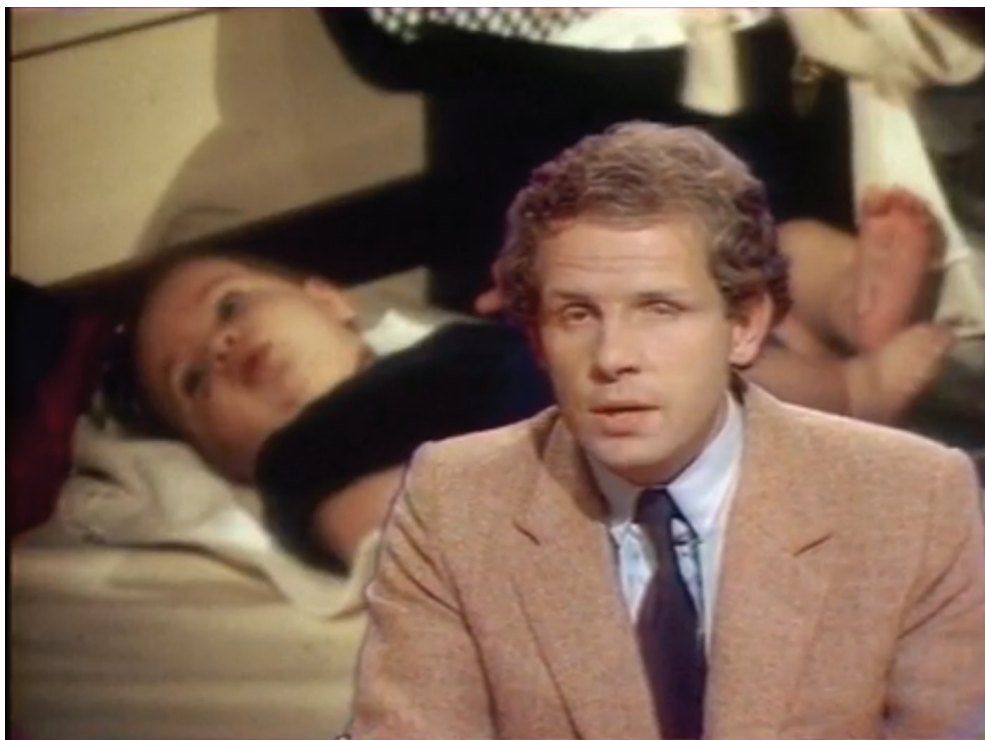
Video 6. 'Emission du 19 octobre 1979', Journal de 20 Heure , 19 October 1979, Antenne 2 (INA). The Morhange baby powder trial on television.