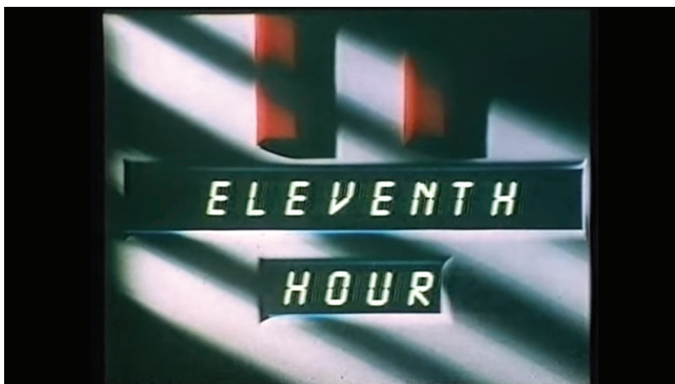
Video 3. 'We're not mad, we're angry' a documentary-drama, Channel 4, 1986.

This ideology can be seen very much in play in Channel 4's Mind's Eye mental health season. This season was distinctive in that it allowed extensive opportunities for self-representation, championing the first-hand experiences of people living with mental health conditions and allowing them to determine the narrative collaboratively. It offered a direct challenge to the dominant bio-medical model of mental illness. It was also innovative in format and style, blurring lines between genre. It included We're Not mad, We're Angry , a documentary-drama authored in collaboration with a group of mental health service users offering a highly personalised and political account of their views on the failures and injustice of the psychiatric system. Another of the programmes, In the Mind's Eye used the poetry and writings of a patient and staff writers group at Fairfields Psychiatric Hospital as the jumping off point to give the viewer a highly stylised and at times disorientating insight into their experiences.