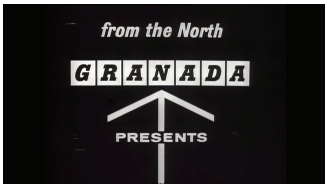
Video 2. The opening section of World In Action : 'Ward 13', Granada for ITV 1968.

This short regional report did not attempt to establish why the interviewee above was in hospital for such a long time. It focussed on the positives of this local scheme, presenting it as a sign of progress. However, around this time, both the BBC and its commercial rival ITV aired more overtly critical investigations into the provision of mental health treatment. Their flagship current affairs strands, This Week : 'Mental illness in Great Britain' (ITV, 1964) and Panorama 'On mental illness' (BBC, 1966), directly addressed issues such as long term detention, conditions in psychiatric hospitals and the efficacy of a community-based treatment model. These programmes canvassed a wide range of opinions, including interviews with psychiatrists, community mental health workers, families and ex-patients. The context of these programmes was a growing commitment to current affairs output as television attempted to be taken seriously as a medium. 24 ITV, whilst a commercial enterprise, was held to a similar remit to that of the BBC, requiring it to provide a suitable balance of information, education and entertainment programmes. 25 It was heavily criticised for its populist approach in the 1962 Pilkington report into British Broadcasting and ordered to up its commitment to public service values. This saw a renewed emphasis on serious programme making and journalistic values at the channel. 26