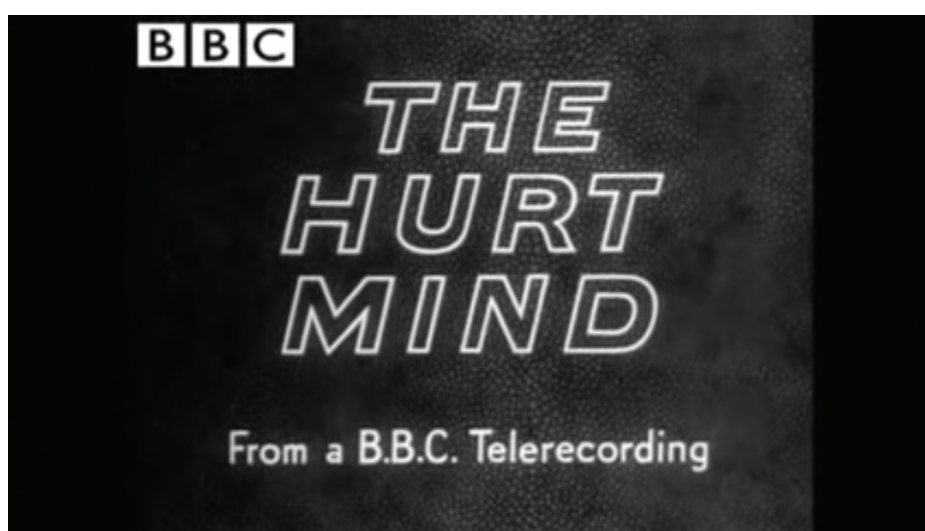
Video 1. ECT demonstration in The Hurt Mind , Episode 5 'Physical Treatment's, BBC1, 1957.

The public service mandate to provide the British public access to a wide range of the best scientific, political and cultural perspectives left little space for the 'lay expert' in television programming of the time. Therefore, whilst some patients were interviewed, it is in the context of giving brief testimonial support to the psychiatric experts. Simon Cross argues that where individuals with first-hand experience of mental distress were featured in these early programmes, their role was limited to reinforcing psychiatric authority rather than having a true voice. 17 This is illustrated by the demonstration of electro-convulsive-treatment in Episode 5: 'Physical Treatments'.