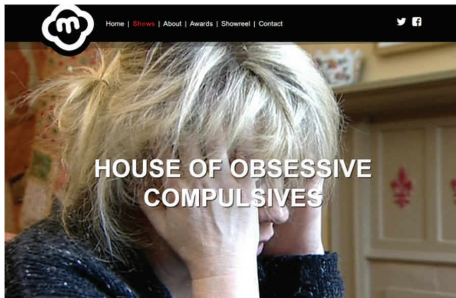
Figure 2. Screen grab of promo for House of Obsessive Compulsives on Monkey Kingdom website.

The first series of this kind tackling mental health was The House of Obsessive Compulsives (Channel 4, 2005). This two-part series brought three people with obsessive compulsive disorder together in a house for intensive cognitive behavioural therapy (with exposure response prevention) led by a therapy team from the NHS Maudsley Hospital's Centre for Anxiety Disorders and Trauma. A review in the British Medical Journal by a psychiatrist illustrated how this show was seen as taking elements of Big Brother 57 and applying them to a serious subject matter: