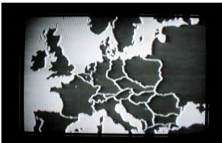
Fig. 1. ESC 1963, BBC 23 March 1963

During this period the European map was rarely used as a visual element in the ESC. When it was, the maps ignored the Cold War division in Europe that otherwise structured the contest. The 1963 ESC introduced the entries with a map of Europe.