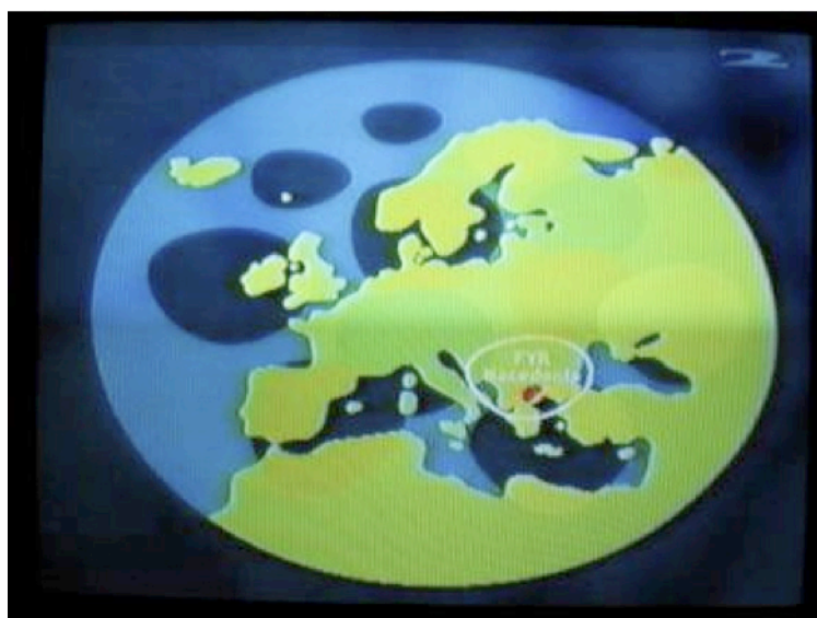
Fig. 4. ESC 2002, ETV 25 May 2002

featured national borders, since 2001 these have been left out (apart from a customary zoom-in to the country whose votes will be shown next). The 1998, 1999 and 2001 maps differentiated the participating countries from non-participants with different colours, producing very patchy images of Europe. Since 2001, when the ESC was held in the former Intervision territory for the first time, the maps have not singled out participating countries. Thus, the ESC maps produce a stylized image of Europe with no clear boundaries, emphasizing unity over national borders.