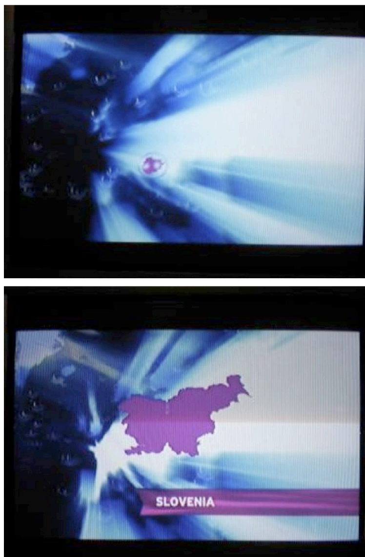
Fig. 5-6. ESC 2006, ERT 20 May 2006

In the 2007 contest on the other hand we first see a simple map of Europe with no national boundaries. A yellow finger appears, points at a country whose contours become briefly visible on the map, and as we cut to a close up of the country, it quickly dissolves into a colourful kaleidoscopic image.