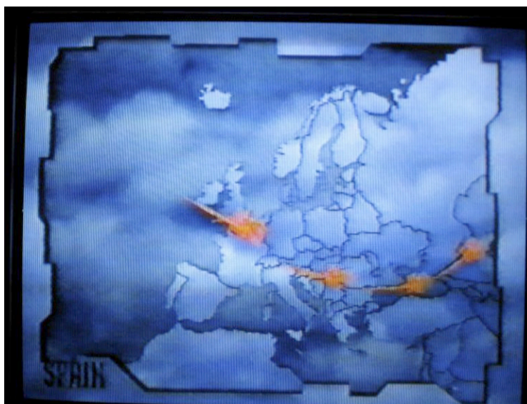
Fig. 2. ESC 1996, NRK 18 May 1996

The European maps of the ESC create an ever-widening image of Europe. The framing in the 1996 map is already wider than in the 1963 ESC, showing all the Nordic countries as well as some of Northern Russia, North Africa and the Middle East.